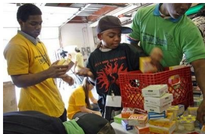
Left: SSCC teens doing community service. Right: Teens with Noble Peace Prize Winner Roberta Menchu Tum.

Poverty to Peace is an innovative initiative begun by the Peace Jam foundation in order to engage AmeriCorps VISTA members in a national effort to help local Peace Jam affiliates and chapters to implement and sustain high quality Peace Jam programming for at-risk youth and communities. The Goal is to help youth, their families, and their communities move “from poverty to peace” through the development of service-learning projects and practices that address the root causes of poverty by promoting sustainable living practices as defined by environmental, social, and economic justice. South Side Community Coalition’s Teen Scene has been participating in Peace Jam for four years and are very excited about this new project. Our next meeting to plan our community service project is January 9 from 2 to 4. This year’s theme is Violence Awareness. Teen Scene will be attending their 4th conference this year with Noble Peace Prize Winner Betty Williams from Northern Ireland.