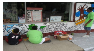
Youth working on Mural on the front of our building